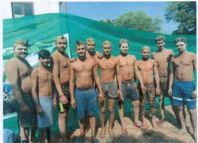
Pics of the Mud Therapy Sessions 16.07.2019